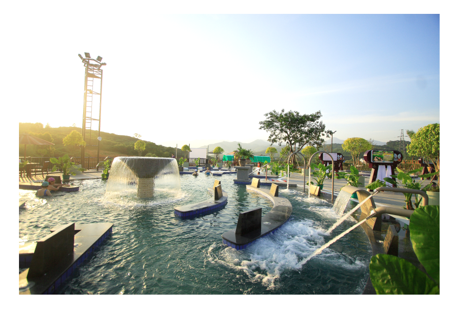
View of Trithorn Hot Spring Resort at Xiamen