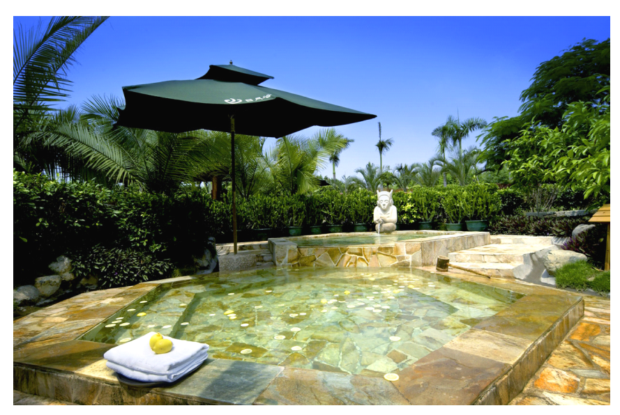
Riyuegu Spring Resort at Xiamen