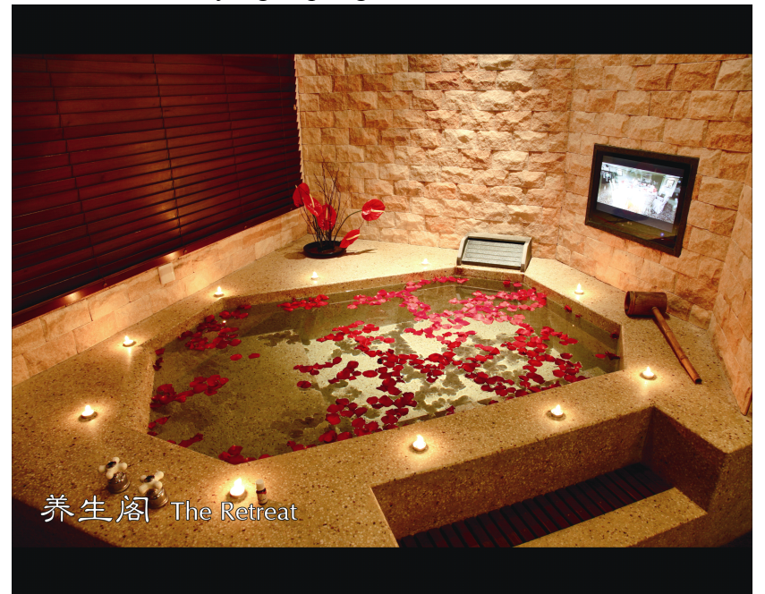
Riyuegu Spring Resort at Xiamen