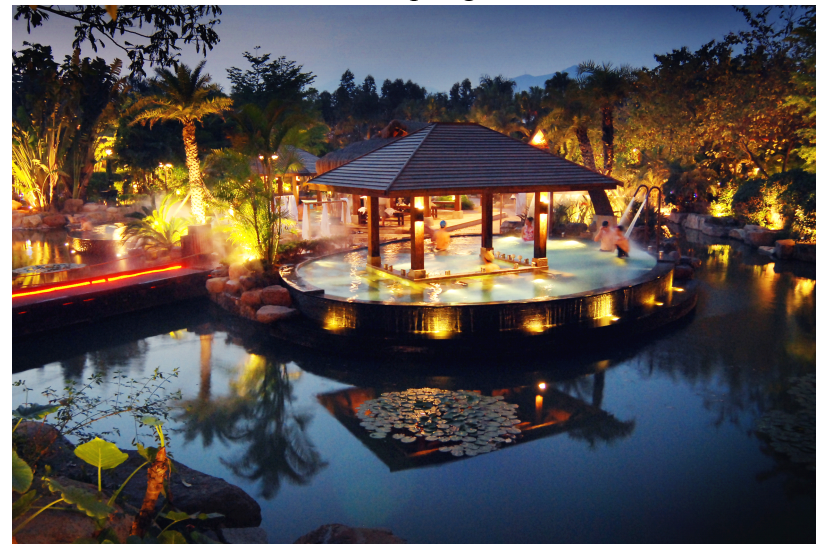
View of Riyuegu Resort at Xiamen