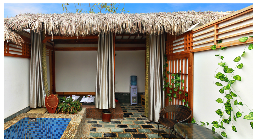
View of Tianmu Hot Spring Resort at Xiamen