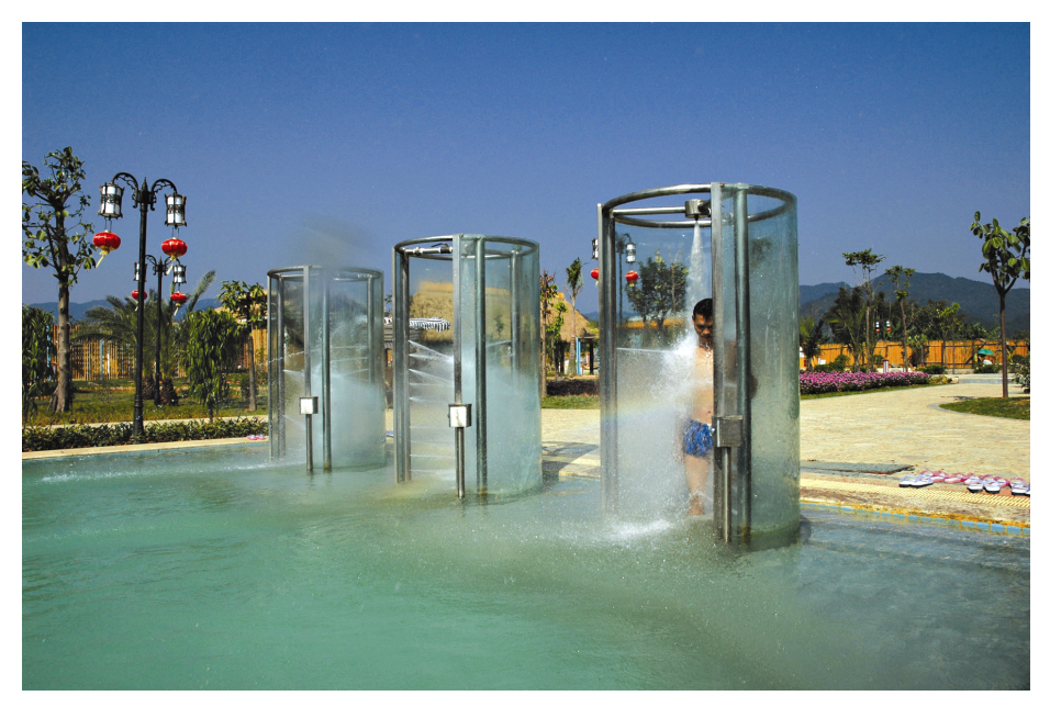
Resort at Nankunshan Mount