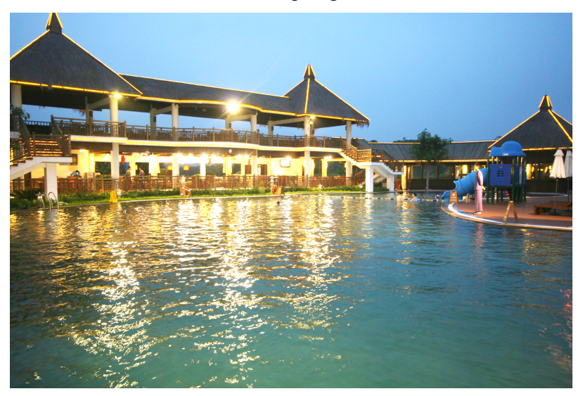
View of Trithorn Hot Spring Resort at Xiamen