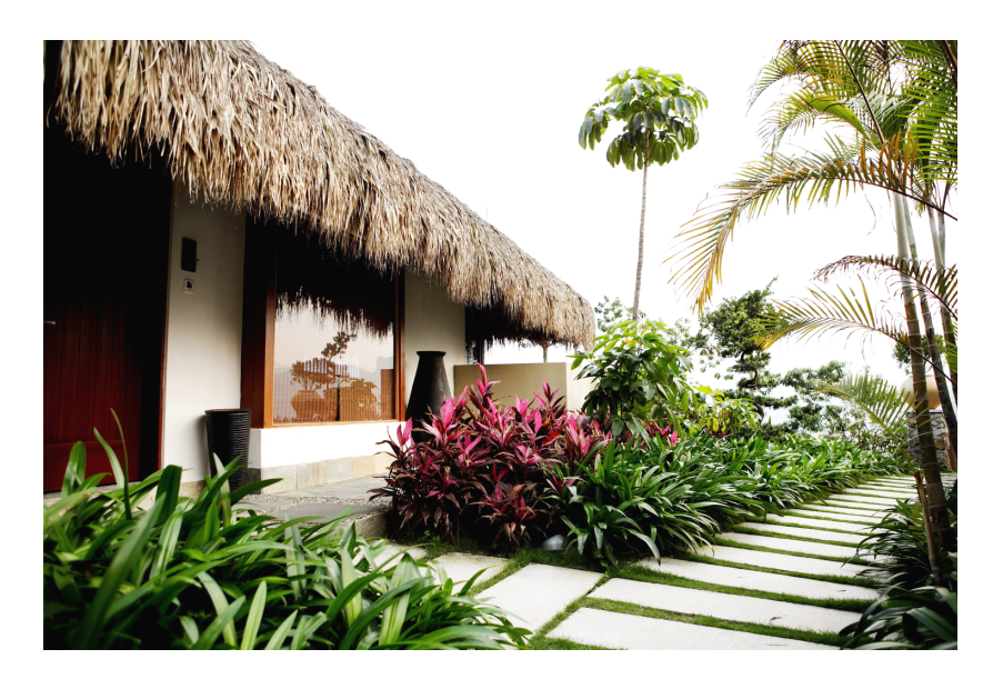
Resort with Bali Style at Nankunshan Mount