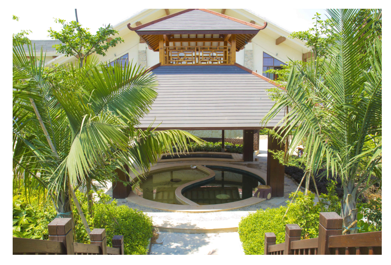
View of Tianmu Hot Spring Resort at Xiamen