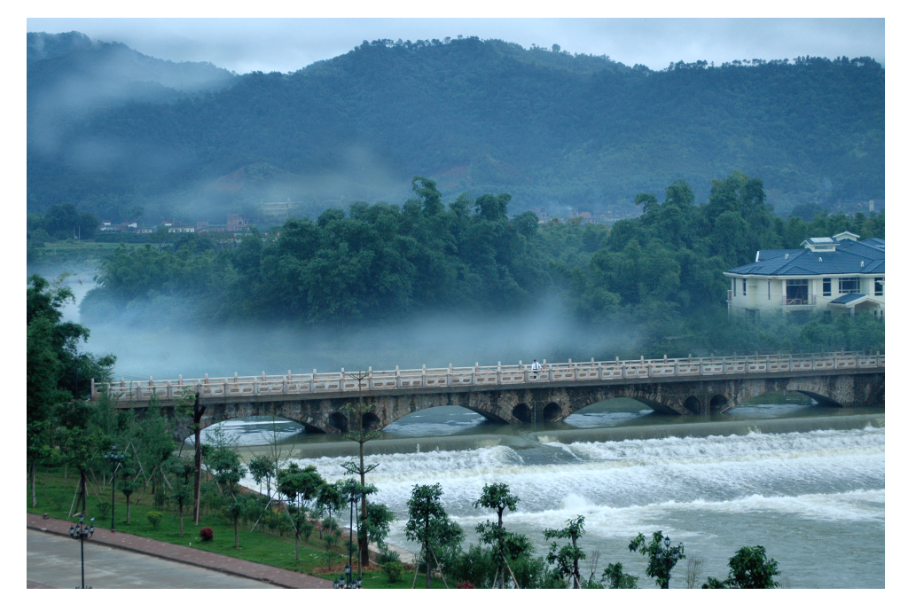
A glimpse of Nankunshan Mount

Equipped with luxury suites, VIP villas, Restaurant with Chinese and Western gourmet, water parks, Yuding Hot Spring Resort has attracted a large number of customers due to its picturesque landscape and gorgeous decorations in line with Chinese traditions and folk customs, local cultures and handicrafts.